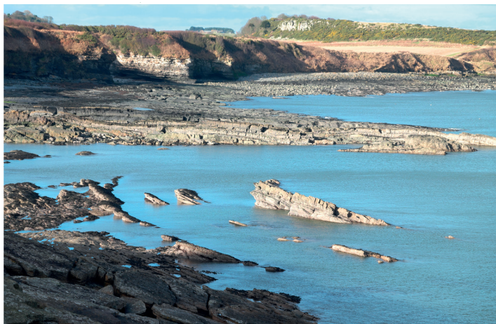
The coast south of Craster

For the first time on this walk you're able to look south along the coast, towards a series of small, golden beaches cradled by long fingers of rock.