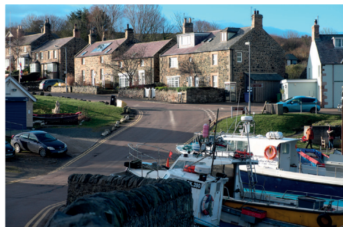
The fishing village of Craster

Passing through a kissing-gate, keep to the seaward side of the first buildings on the southern edge of the village. The path passes to the right of a play area. After a set of steps, the coast path enters the beer garden behind the Jolly Fisherman pub. After a gate on the other side, turn left along a track between the buildings. Go left at the road and then take the lane rising on the right – Whin Hill. Swing right at the top and then follow the narrower path to the left. This leads back to the car park.