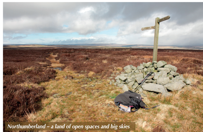
Northumberland – a land of open spaces and big skies

There's something very special about walking in Northumberland. It's got a lot to do with all the history in the landscape – from cliff-top castles and world-class Roman remains to long-abandoned prehistoric settlements hidden in the hills. It's also got something to do with those big northern skies, largely free of pollution, unfettered by man-made constructions and opening up views that stretch on for miles and miles and miles... It's undoubtedly got a lot to do with the landscape itself: remote hills, seemingly endless beaches, wild moors, dramatic geological features and valleys that are so mesmerizingly beautiful they defy description. It's surely related to the wildlife, too – from the feral goats