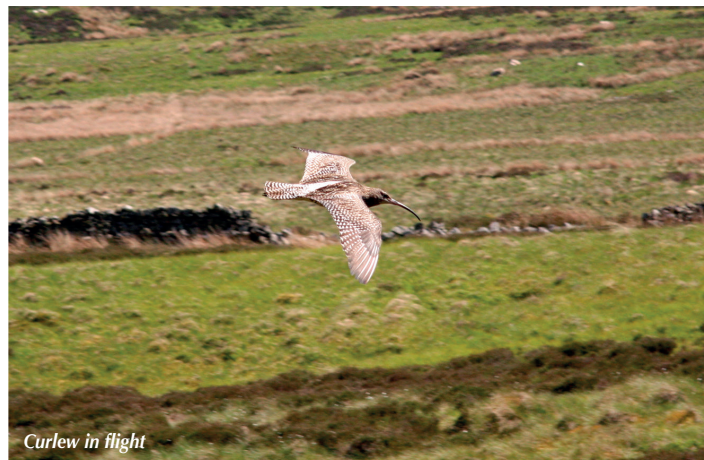
Curlew in flight

The valleys and low-lying woods are home to badgers, roe deer, voles, shrews, minks and otters. Northumberland is also one of England's last bastions of native red squirrels, driven to extinction in other