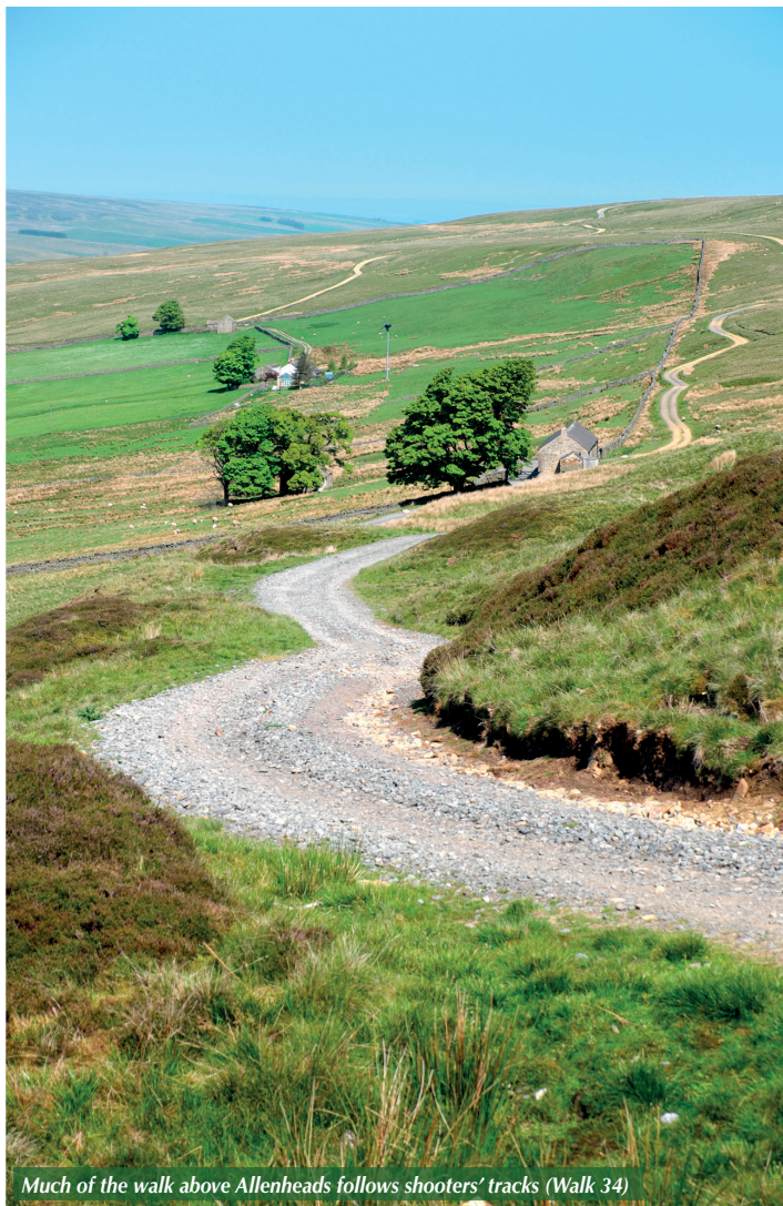
Much of the walk above Allenheads follows shooters' tracks (Walk 34)