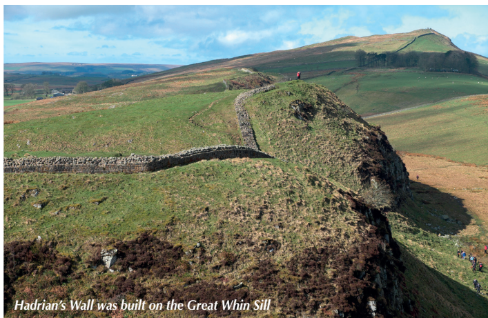
Hadrian's Wall was built on the Great Whin Sill

most famously, the dolerite of the Great Whin Sill, on which Hadrian's Wall and several castles were built. The latter was formed towards the end of the Carboniferous period, when movement of tectonic plates forced magma to be squeezed sideways between beds of existing rock. The magma, as it then slowly cooled, crystallised and shrank, forming hexagonal columns.