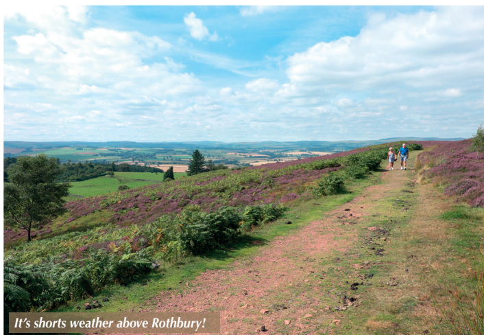
It's shorts weather above Rothbury!

Like the rest of the UK, Northumberland experiences plenty of meteorological variety but, being on the east side of an island dominated by moisture-laden southwesterlies, it tends to be drier and generally more benign than the western side. Having said that, the Pennines and the Cheviot Hills get more than their fair share of strong winds, heavy rain and snow. And, in winter, the easterly winds that periodically come in off the North Sea are enough to bring tears to your eyes. During summer, the coast is prone to sea fog, or haar, an annoyance that will normally burn off quickly, but can linger all day if there's a steady wind coming off the North Sea to keep replenishing the banks of moisture.